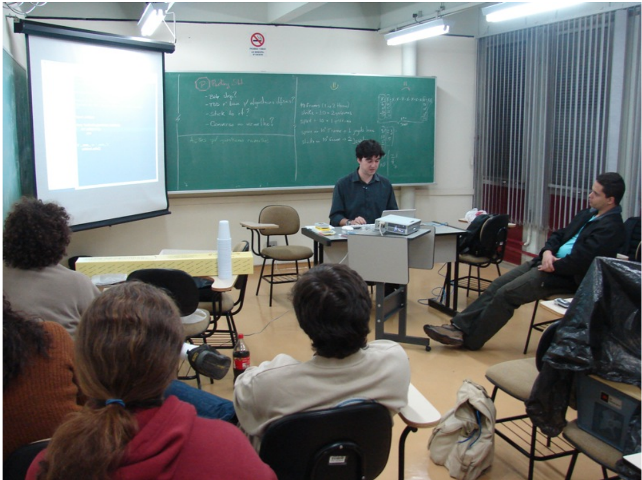
A picture of a Coding Dojo where a functionality is defined on the board.

Also known as To-do List, Class Checklist, TDD Session Roadmap